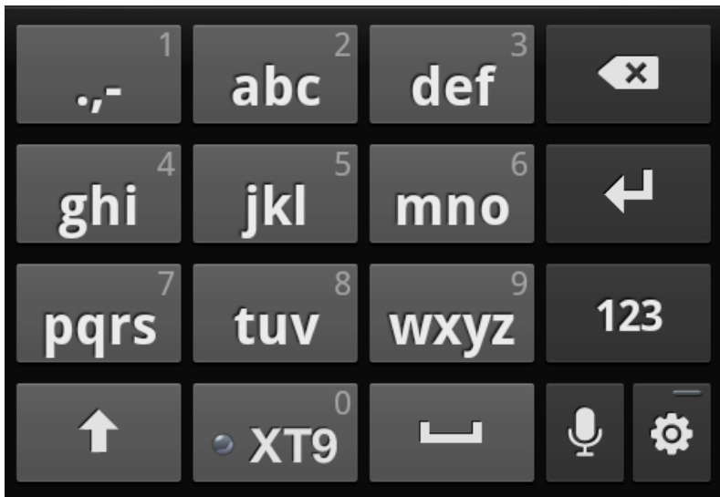
Old-Fashioned Text Messaging

Use an image of an older-style phone keypad (see below) to demonstrate another kind of "encryption" that participants may be familiar with.